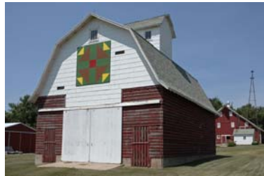
"Hens & Chicks"